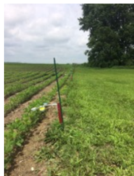
Fig. 1: Honey bee hive in a prairie strip and a grassy border typical of a 'control site' with bee bowls used to measure the diversity of bees at a farm.