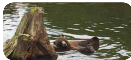
A bear cub enjoys playing in the water

relocated—usually to a zoo. There are several adult bears that have not been placed and remain at The Fortress, but the main focus is caring for the orphaned cubs.